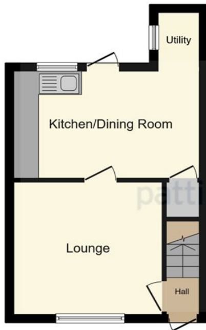
Ground Floor Floor area 29.6 m 2 (319 sq.ft.)