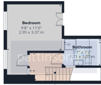
Landing 5'10" x 1'0" 1.80 x 0.31 m