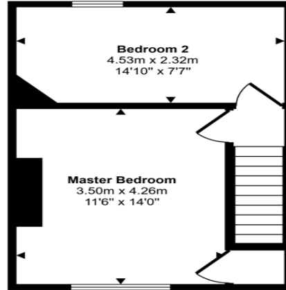
First Floor Approx 30 sq m / 326 sq ft

This floorplan is only for illustrative purposes and is not to scale. Measurements of rooms, doors, windows, and any items are approximate and no responsibility is taken for any error, omission or mis-statement. Icons of items such as bathroom suites are representations only and may not look like the real items. Made with Made Snappy 360.