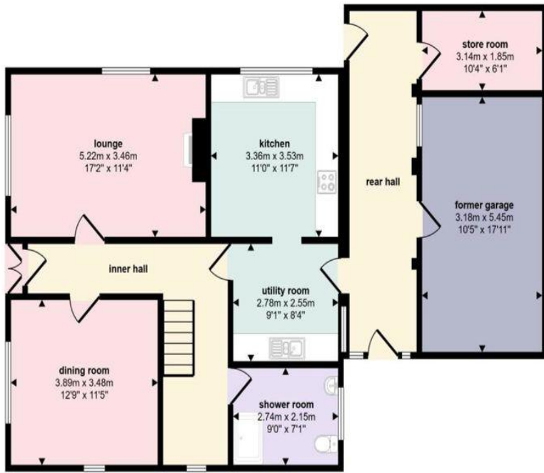
Ground Floor Approx 112 sq m / 1202 sq ft

Approx Gross Internal Area 185 sq m / 1995 sq ft