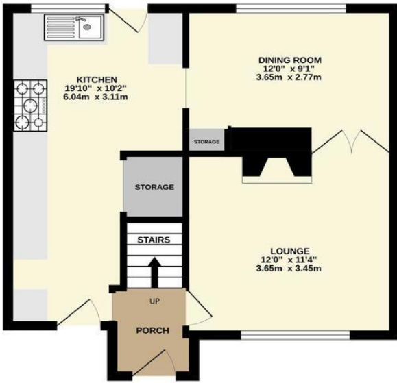
GROUND FLOOR 448 sq.ft. (41.6 sq.m.) approx.