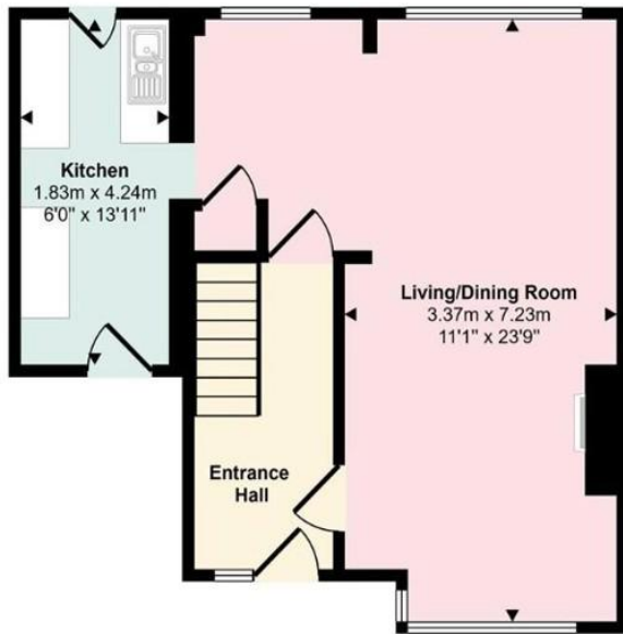
Ground Floor Approx 46 sq m / 492 sq ft

Approx Gross Internal Area 91 sq m / 982 sq ft