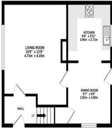
GROUND FLOOR 430 sq.ft. (39.9 sq.m.) approx.