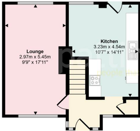
Ground Floor Approx 36 sq m / 392 sq ft

Approx Gross Internal Area 72 sq m / 780 sq ft