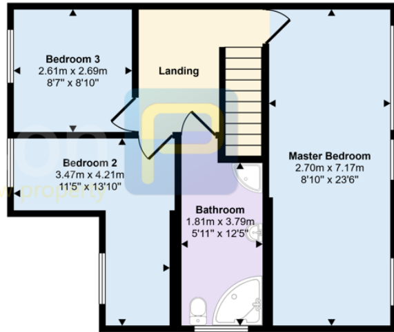
First Floor Approx 54 sq m / 583 sq ft

This floorplan is only for illustrative purposes and is not to scale. Measurements of rooms, doors, windows, and any items are approximate and no responsibility is taken for any error, omission or mis-statement. Icons of items such as bathroom suites are representations only and may not look like the real items. Made with Made Snappy 360.