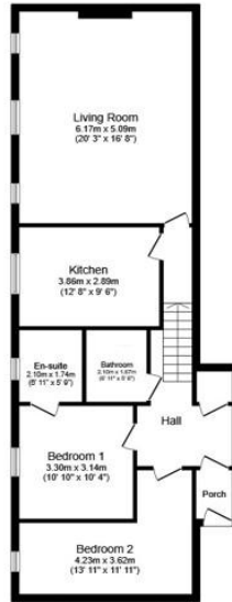
Floor Plan Floor area 85.4 sq.m. (919 sq.ft.)

Total floor area: 85.4 sq.m. (919 sq.ft.)