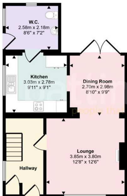
Ground Floor Approx 47 sq m / 506 sq ft

Approx Gross Internal Area 89 sq m / 953 sq ft