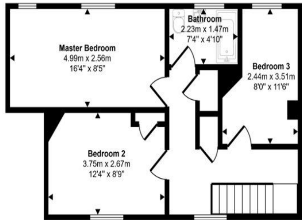
First Floor Approx 46 sq m / 499 sq ft