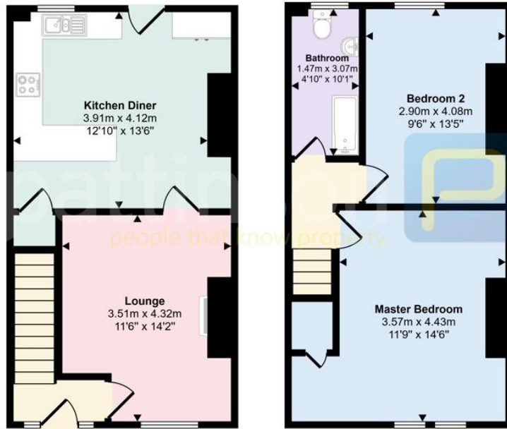
Ground Floor Approx 39 sq m / 417 sq ft

Approx Gross Internal Area 78 sq m / 837 sq ft