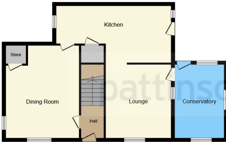
Ground Floor Floor area 80.3 m 2 (865 sq.ft.)